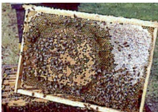
Brood Patch biased towards hive entrance

However, black queens from Savoy, which is a mountainous area, produce colonies with completely different behaviour from bees in our lowland areas. These mountain-colonies winter in the very centre of the hive, with food stored above the cluster, but also with stores placed in front of and to the rear of the cluster. In Spring, the brood-nest is created in the exact centre of the hive. This contrasting behaviour was also found in the F1 offspring (queen of Savoy X Between-Sambre-and-Meuse males) of these queens.