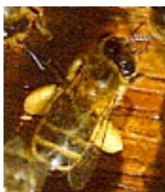
Baskets of pollen

The harvest of pollen is well adapted to the environment and characteristic of the various local varieties of black bee. A precise description is provided elsewhere on this site.