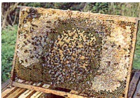
Savoy Brood Patch very central on combs

However, black queens from Savoy, which is a mountainous area, produce colonies with completely different behaviour from bees in our lowland areas. These mountain-colonies winter in the very centre of the hive, with food stored above the cluster, but also with stores placed in front of and to the rear of the cluster. In Spring, the brood-nest is created in the exact centre of the hive. This contrasting behaviour was also found in the F1 offspring (queen of Savoy X Between-Sambre-and-Meuse males) of these queens.